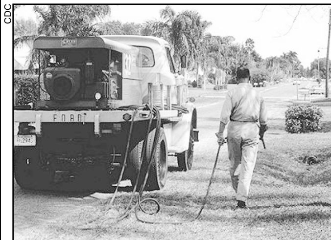
Community spray programs are a common response to West Nile virus outbreaks.

the environment. See “Hazards of Pesticides Used to Kill Adult Mosquitoes,” page 7 and “Hazards of Pesticides Used to Kill Mosquito Larvae,” page 8.