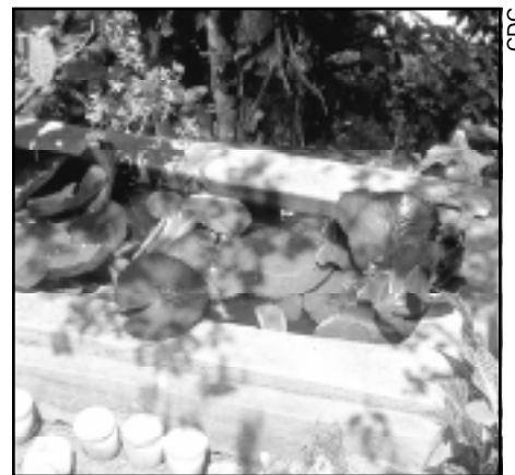
Backyard ponds are excellent mosquito habitat.

The most important action you can take to control mosquito populations is to reduce mosquito breeding sites around your home and neighborhood, often referred to as “source reduction.” The U.S. Centers for Disease Control and Prevention’s (CDC’s) evaluation of source reduction is that it “remains the most effective and economical method of providing long-term mosquito control in many habitats.” 19