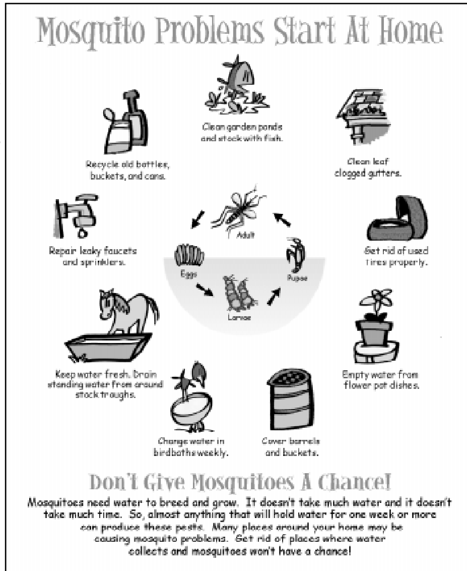
An educational flier prepared by the Washington State Department of Health.