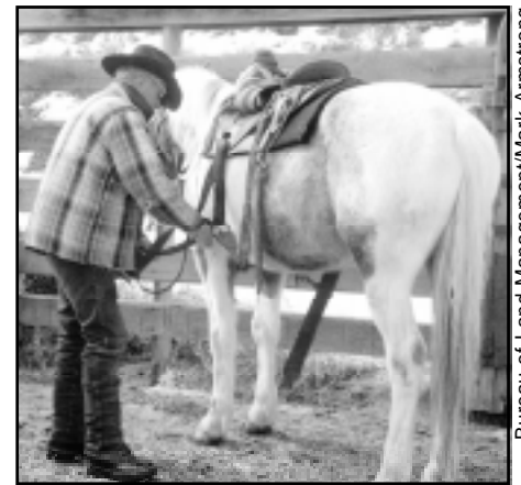
Bureau of Land Management/Mark Armstrong

WNV does not often cause severe illness in dogs and cats. A study of dogs in New York City following the 1999 cases indicated that dogs are frequently infected, but rarely become ill. There has been one documented case of illness in cats. 9