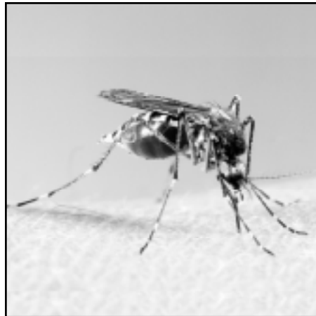
U.S. Dept. of Agriculture

West Nile virus (WNV) is a mosquito-transmitted virus first identified in the West Nile District of Uganda in 1937. 1 Until 1999 when the first documented cases occurred in New York City, the virus was found only in the Eastern Hemisphere in parts of Africa,